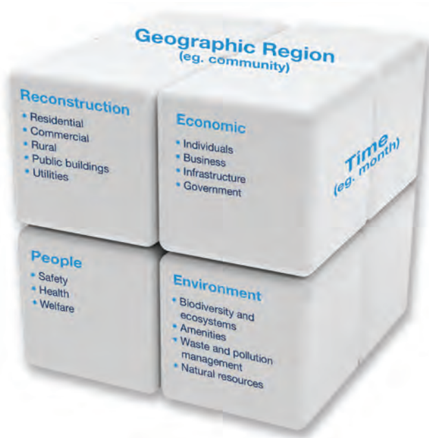
Figure 4 – Data collection model