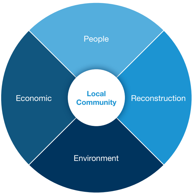
Figure 2 – Disaster Recovery Framework