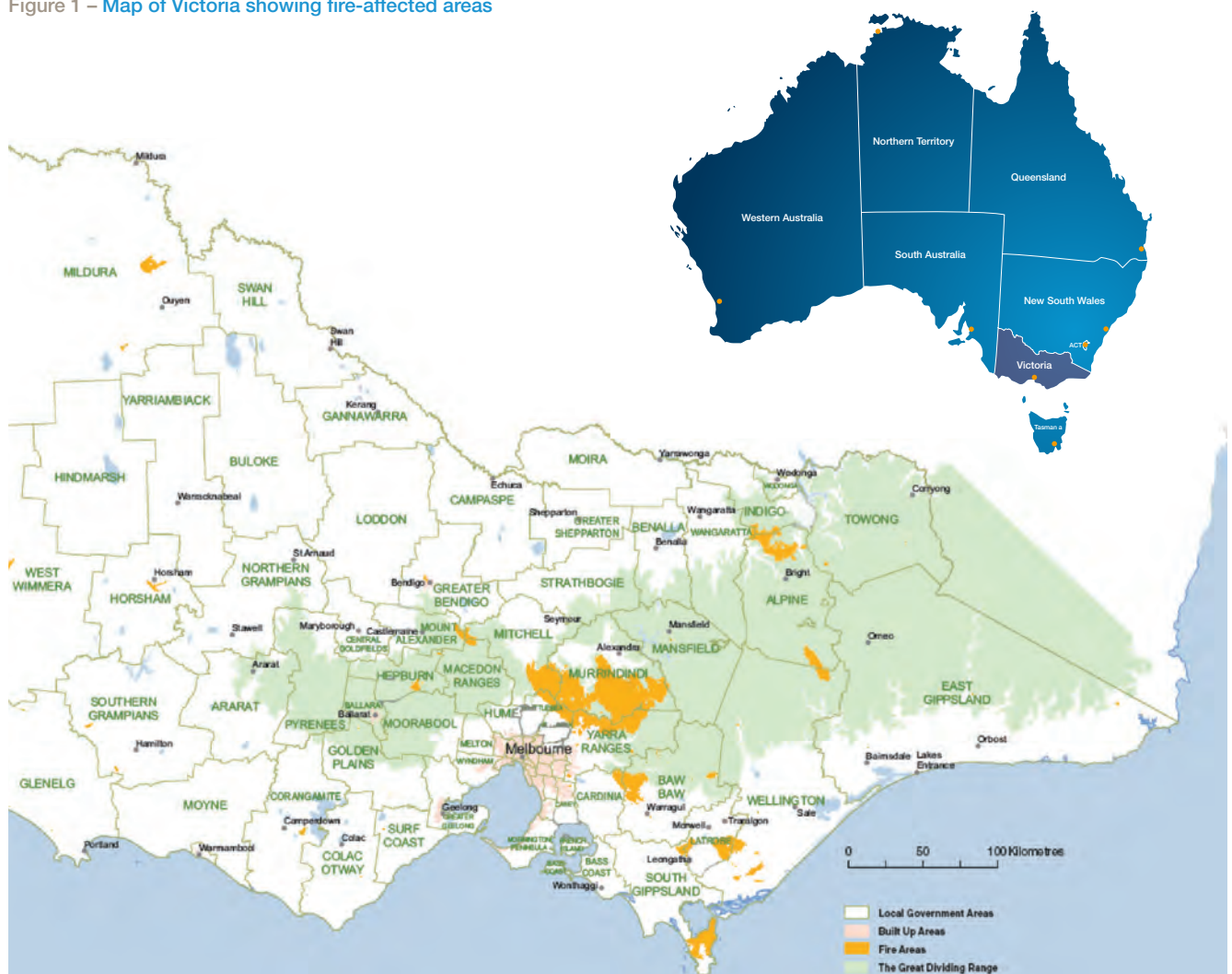
Figure 1 – Map of Victoria showing fire-affected areas

Source: VBRRA's Community Engagement Strategy