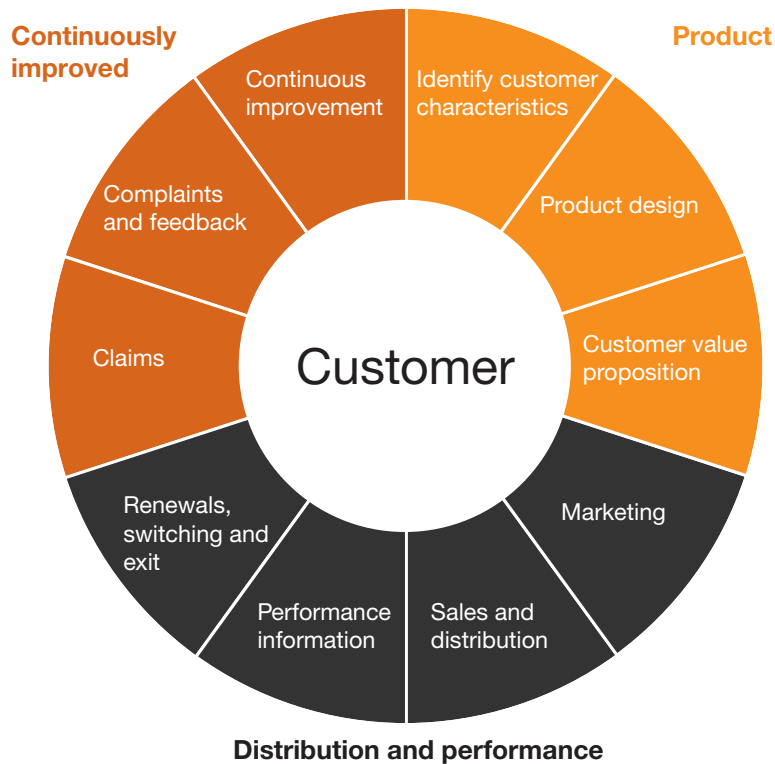
Figure 3: A customer-led and holistic approach to DDO