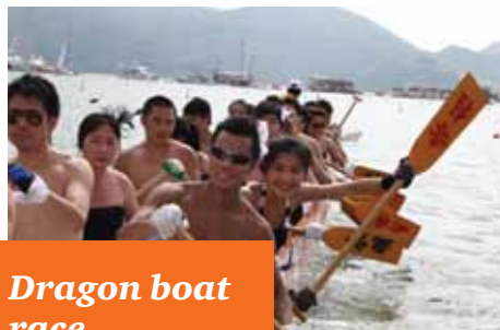
Dragon boat race