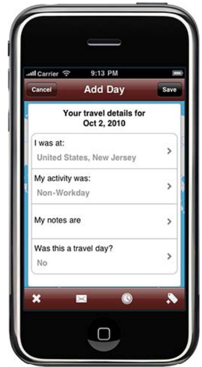
PwC mobile iPhone app

BusinessTravelWatch also includes a compendium of global tax compliance rules and treaties for supported countries.