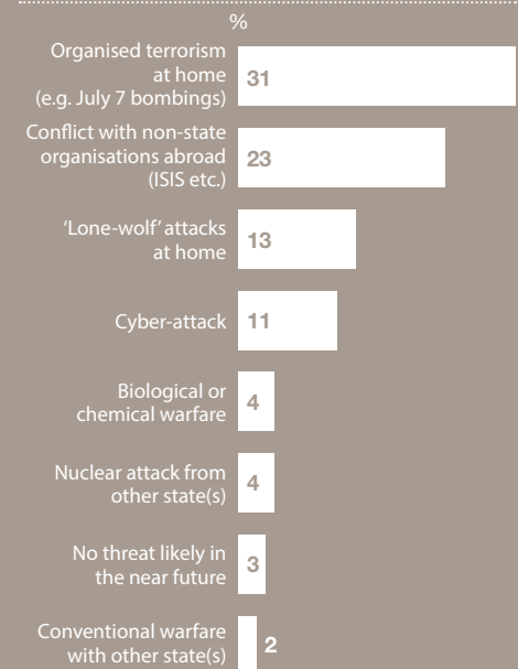
Figure 2: What type of attack, if any, do you perceive as the biggest threat to the UK in the near future?

Base: 2,007. Don't know: 9%. Other: 1% Source: Forces for Change, PwC, 2015